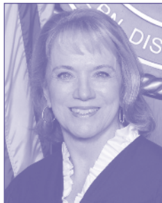
Hon. Cecelia G. Morris Chief Judge U.S. Bankruptcy Court S.D.N.Y.