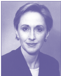
Hon. Carla E. Craig Chief Judge U.S. Bankruptcy Court E.D.N.Y.